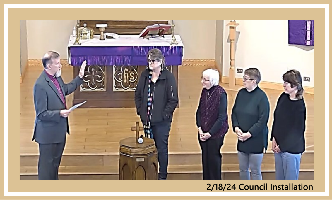
2/18/24 Council Installation